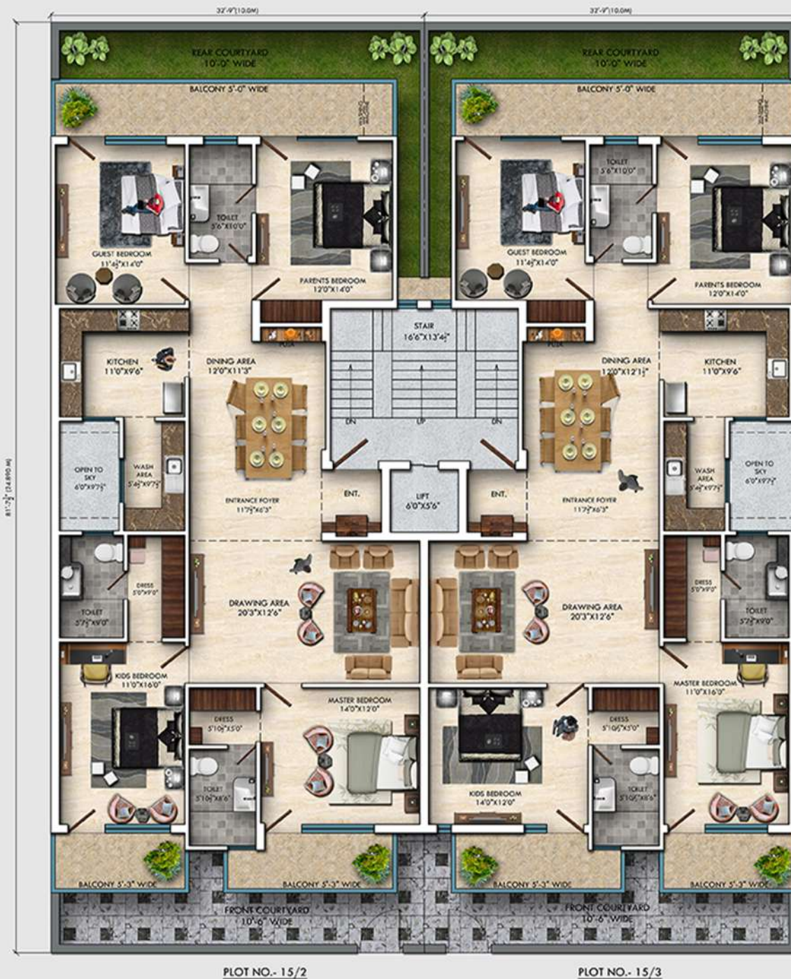
PLOT NO.- 15/2